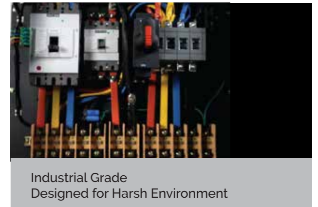
Industrial Grade Designed for Harsh Environment