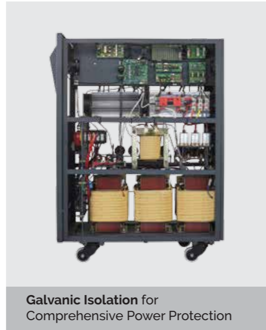
Galvanic Isolation for Comprehensive Power Protection

Provides protection of loads against lightning. Galvanic isolation via transformer is the only way to safely protect loads from lightning. It provides protection from high energy transients, which are clamped at the AC input from propagating to the output.