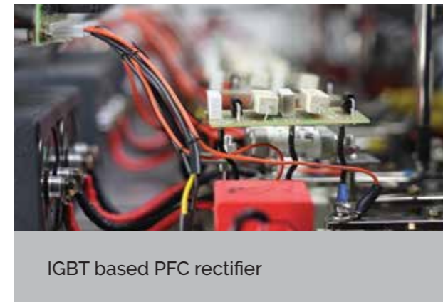
IGBT based PFC rectifier